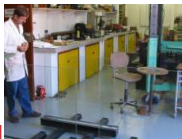
SABS Tested Products