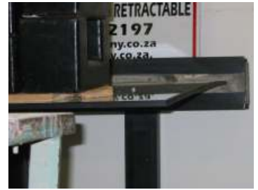
SABS Testing on Balustrade Glass